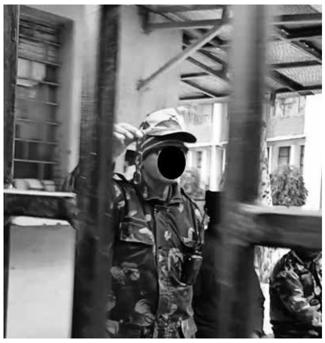
Guard holding up broken lock and chain from forced entry at Gate 4

Upon entering from these three gates, the forces blocked entry and exit, took over all the pathways surrounding the polytechnic building area leading